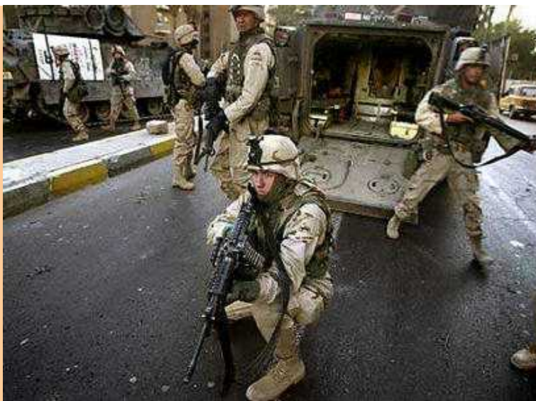
U.S. soldiers are shown at the site of attacks in central Baghdad, November 21, 2003.

Top 10 National News Story Briefs and Headlines, with links to the Full Stories